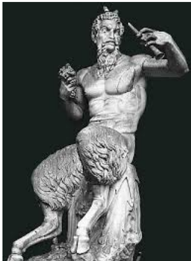
Pan or Azazel