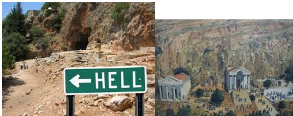
Pan's Grotto or the "Gates of Hell" today and the shrine is Jesus' day.

There is a place in the Golan Heights in Israel that has a sign pointing to "HELL". Below is a picture of this tourist attraction. In Jesus day it was known as " The gates of hell " by the Jews or the Grotto of Pan by the Greeks and Romans. It is important for the Kingdom Church to understand what happened here, what Jesus said and did here and what satan did here...very important!